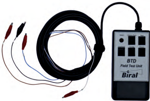
BTD-300 Field Test Unit

The BTD-300 Field Test Unit is a simple battery powered device which simulates lightning in several range bands. It can be used as part of commissioning tests or during routine maintenance activities to enhance user confidence.