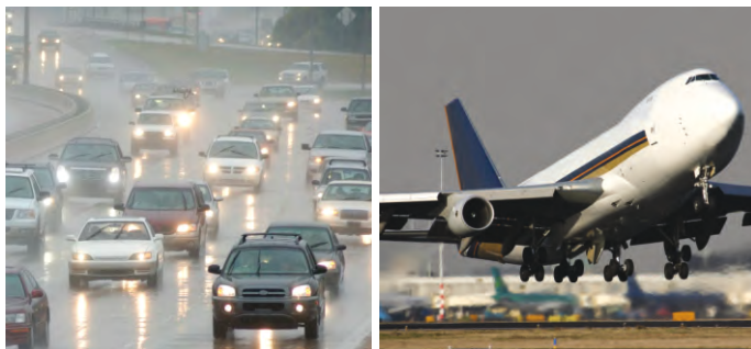
Suitable for a range of applications.

Airports need to monitor visibility across the airfield to ensure the safety of taxiing aircraft, for Runway Visual Range (RVR) calculation and for transmission to aircraft as part of the METAR. The SWS-200 can fulfil all of these roles and also provides present weather information for inclusion in METAR reports.