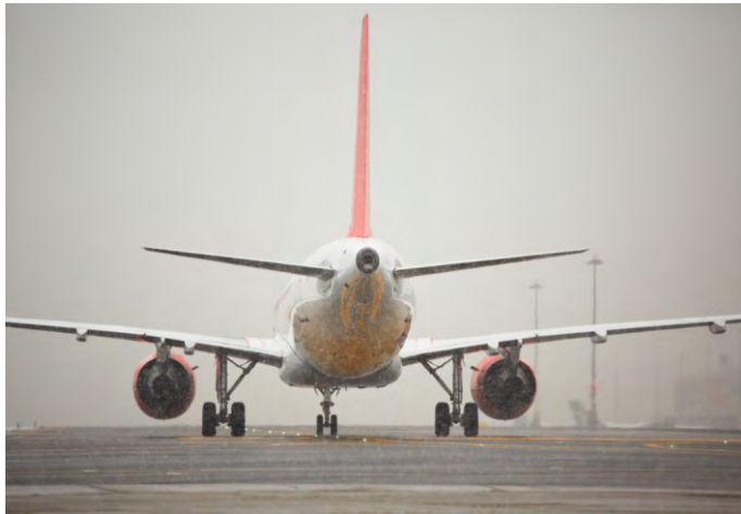
Designed for aviation, roads, research and general meteorological use.

range of 10m to 40km, and atmospheric Extinction Coefficient (EXCO). The features, accuracy and resolution of the SWS-050 ensure it complies with ICAO and WMO specifications for aviation use including use in instrumented Runway Visual Range (RVR) systems.