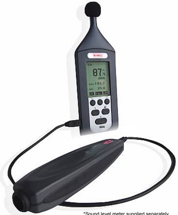
*Sound level meter supplied separately